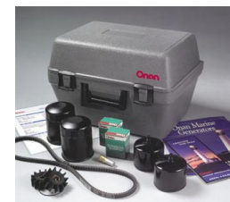
Optional Cruise Kit