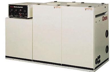
Onan Optional Sound Shield