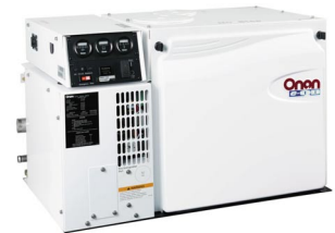
Onan Optional Sound Shield Model pictured has optional gauges