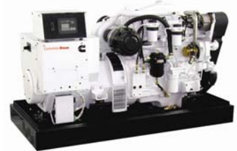
Standard model without sound shield