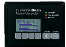
Cummins Onan Digital Display