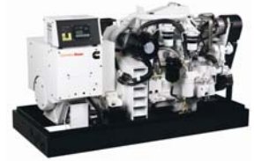
Standard model without sound shield